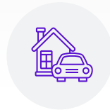
Property & Casualty